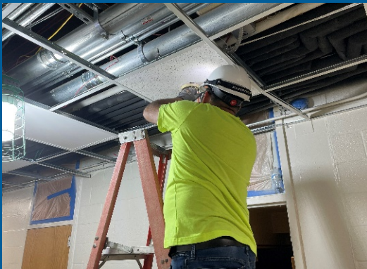
Devices being installed into ceiling tile