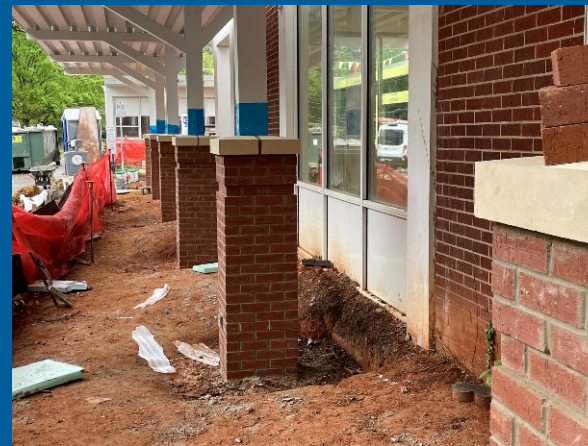
Brick and Cast stone canopy columns installed