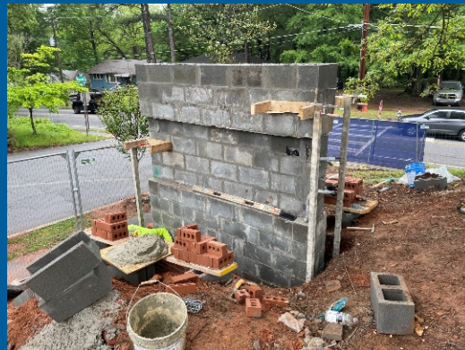
L.E.D Monument sign CMU and Brick Installation Ongoing