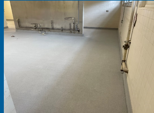
Kitchen Epoxy being installed