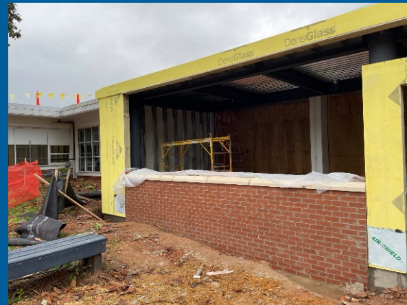
Security Vestibule Brick & Cast stone wall installed