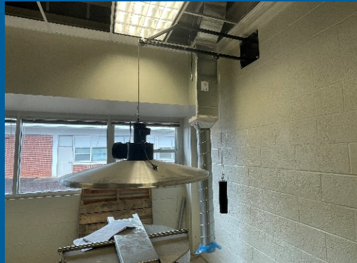
Kiln Hood and Ductwork installed